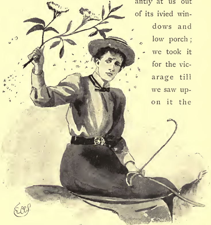
The first flies.

in the air. The old Cannoffice Inn looked pleasantly at us out of its ivied windows and low porch; we took it for the vicarage till we saw upon it the